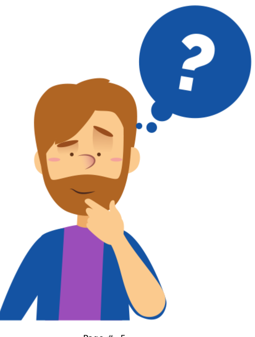
Page # 5