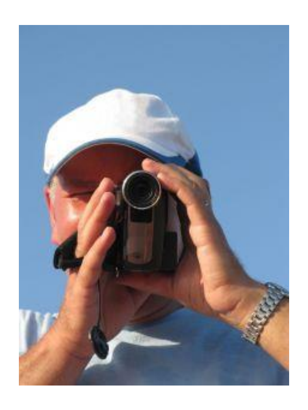
Video Product Perfection

Video products are another way of creating product awareness and promoting one's business through the product. The video production is meant to showcase moving images to be done on electronic media. Similar to film making it only defer in the images being recoded electronically rather than on film stock. Get all the info you need here.