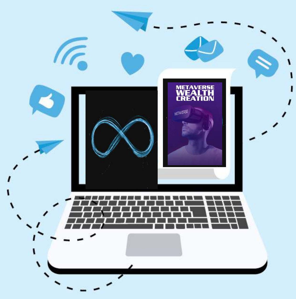
Focussed On eBooks