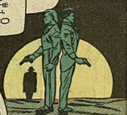
Here in America a good left and a right replaces death duels. Good sportsmanship win or lose values a hundred nicks in a pistol....