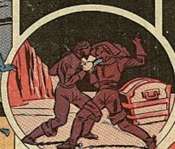
The cavaliers first regard was for his opponent's equal chance...