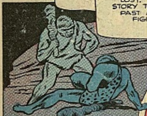
Even the earliest men practiced some chivalry....