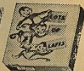
LOTS OF LAFFS HUMOROUS EVERYDAY ASSORTMENT Novel animated cards —including original cut-outs, 3-dimensional pop-out features, bell attachments and 36" novelty card