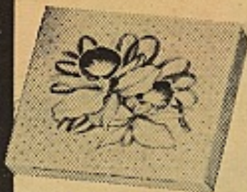
DELUXE EVERYDAY GIFT WRAPPING ENSEMBLE 20 large multi-color 20" x 30" sheets in a fascinating variety of designs—plus matching seals and gift tags