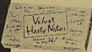
VELVET HASTY NOTES French folders with friendly messages on front in luminous rose and blue velvety flocking