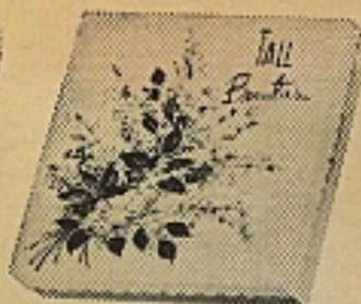
TALL BEAUTIES ALL OCCASION ASSORTMENT Beautifully styled and delightfully different— all gold bronzed and embossed