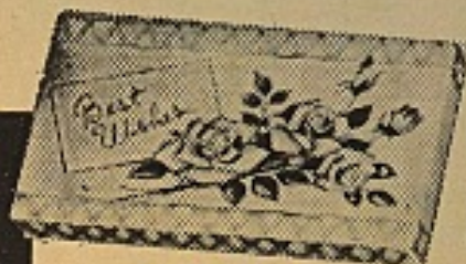
BEST WISHES ALL OCCASION ASSORTMENT 21 luxurious cards— including gold bronzing, dainty hand finishing, matching pastel envelopes