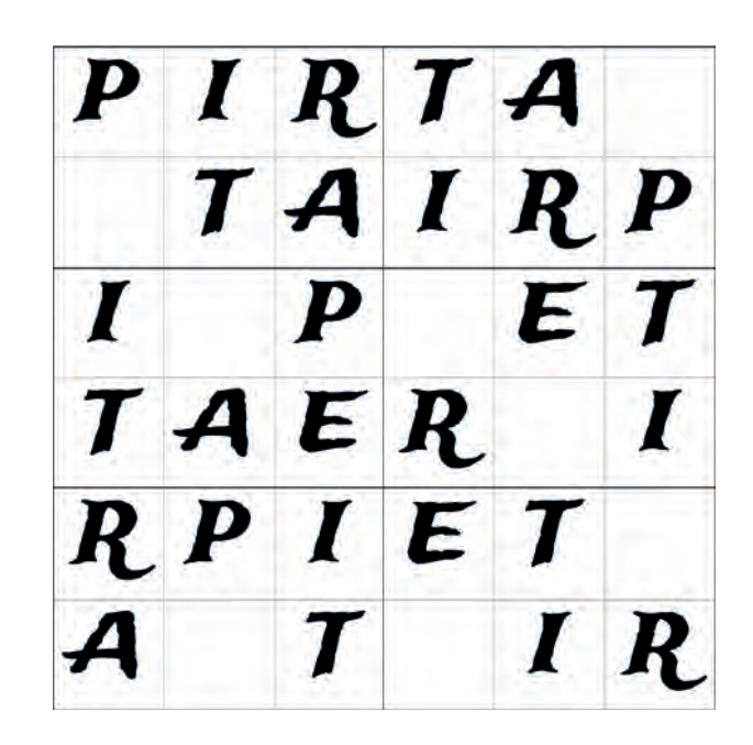
Puzzle 4 6x6 Very Easy