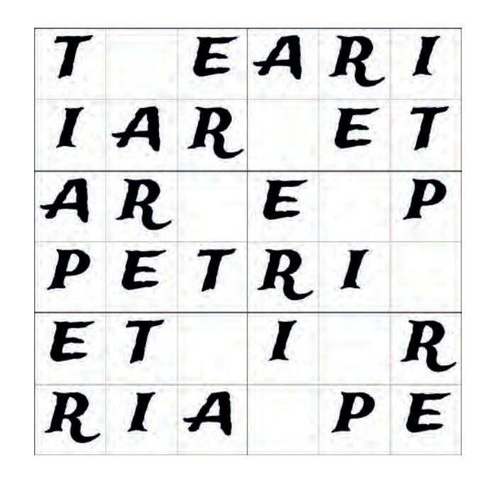
Puzzle 7 6x6 Very Easy